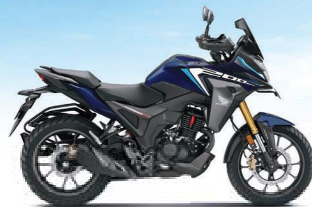
DECENT BLUE METALLIC